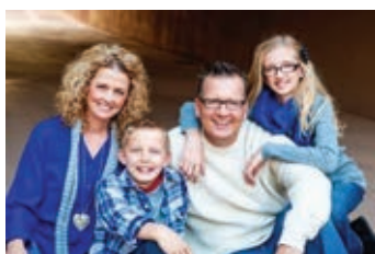
Grayhawk's Top Selling Agent! 2013, 2014