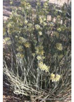
Working with the Landscape Committee, DLC will install 300 Desert Milkweed plants at Grayhawk. This will help attract migrating Monarch butterflies.

to the Sonoran Desert and commonly used in landscapes. In fact, there are a few Milkweed plants near the Grayhawk Community Association office. The plants are quite aesthetically stunning: a dense cluster of silvery grey-green stems that are virtually leafless; pale yellow flowers appear from spring until fall.