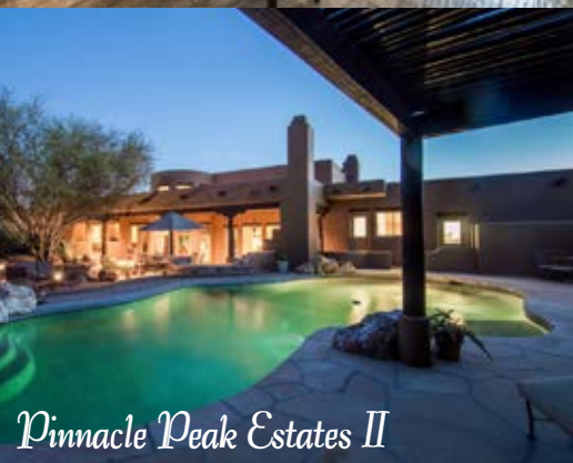
Pinnacle Peak Estates II