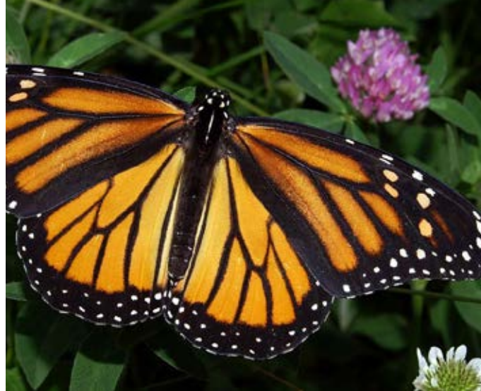
Monarch butterfly habitats have been declining due to development and agricultural practices.

Desert Milkweed — actually not a weed, as the name implies — is native