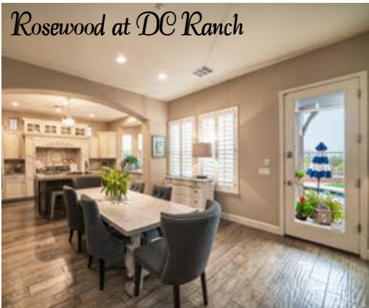
Rosewood at DC Ranch

JOIN CASHMAN PARTNERS FOR SPRING CLEANING!