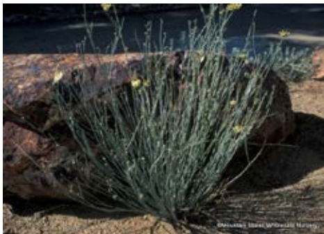
Desert Milkweed have a dense cluster silvery grey-green stems that are virtually leafless; pale yellow flowers appear from spring until fall.

We’re excited for the opportunity to help create beautiful and educational parks for Grayhawk residents to enjoy. It’s an added bonus that the gardens will help care for the environment and these beautiful butterflies.