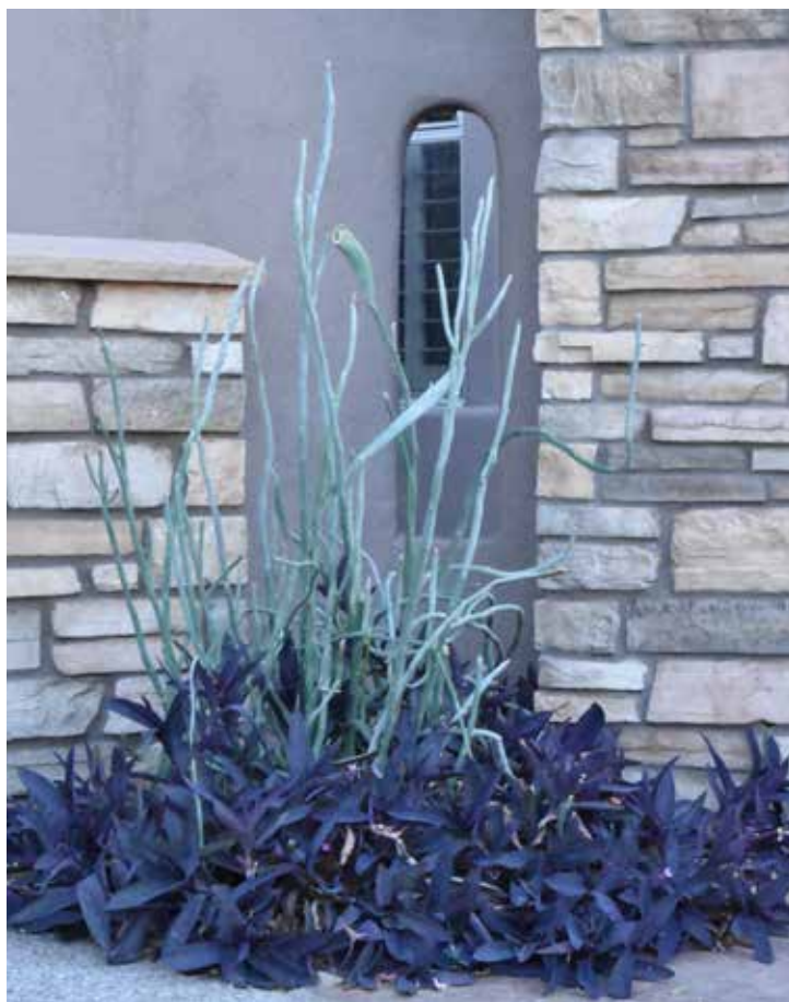
Grey Slipper Plant Surrounded by Purple Hearts

Up next is a plant that is virtually bullet-proof. Moroccan Mounds are a bit on the expensive side but they are such reliable performers, they're worth the investment. These require full sun and like hot spots and as long as you provide both, they will love you back for years. Whether you plant it in the ground or in a pot, just don't over water. Think of all those fat stems as a water storage system; you and the plant will be fine.