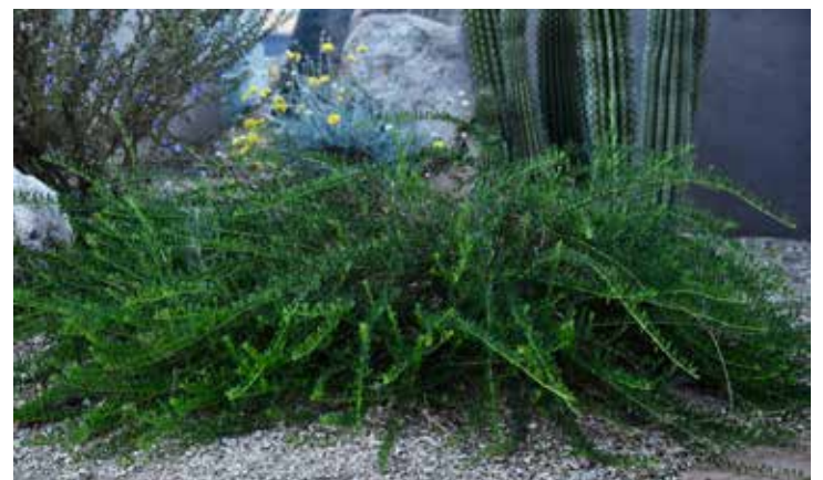
Eremophila maculata 'Outback Sunrise'

Our first example is the Outback Sunrise. If you have a big blank sunny spot in your yard, give this plant a try. It is dark green, evergreen with 1" yellow flowers from February to May. As an added bonus, hummingbirds love them.