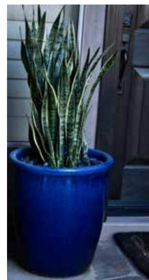
Sansevieria trifasciata laurentii aka Snake Plant

Plant these in a colorful pot or in the ground and they will reward you for years on end. And, the best part? You can pick them up at Fry's for about half the cost of your local nursery.