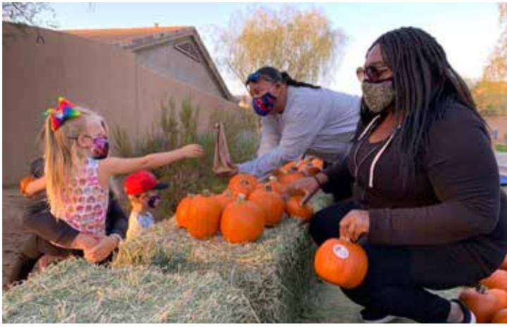
The Great Grayhawk Pumpkin Delivery