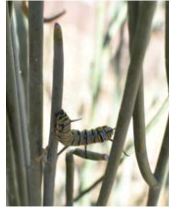
Monarch Caterpillar on Desert Milkweed

And, just because you're being mindful does not mean there isn't room for a bit of selfishness. Plant your Monarch garden in your backyard where you can truly enjoy your new winged-visitors.