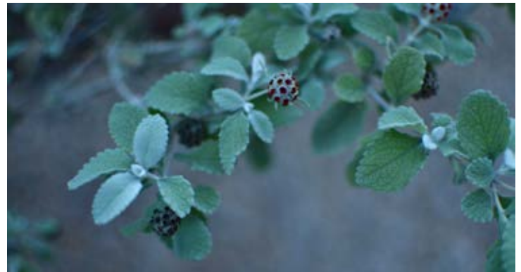
Woolly Butterfly Bush Foliage Detail

Adding more of these plants to our residences and common areas has an added benefit: it creates more diversity in our ecosystem. If you look around, you may notice that our Grayhawk environment is dominated by Palo Verdes, Mesquites and Sage bushes. As these plants mature and ultimately die, we have an opportunity to create a more diverse ecosystem that is more beneficial to a wide variety of pollinators: bees, butterflies, and hummingbirds just to name a few.