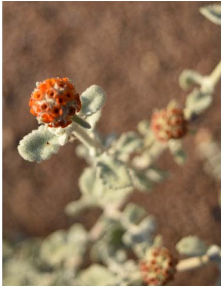
Woolly Butterfly Bush Flower

drought and what I like to think of as benign neglect. And, at 3'x3', they are compact enough to fit just about anywhere. These may require a severe cutting back every few years, but that aside, they are nearly maintenance free. Oh, and no worries about them in winter; they are hardy to -10°.