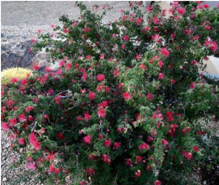
Red Fairy Duster