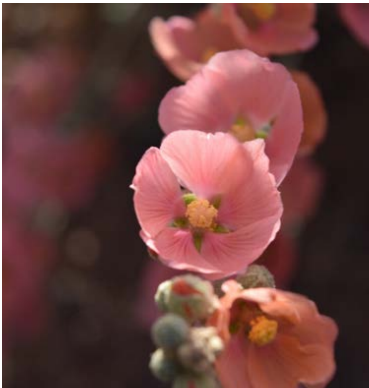
Globe Mallow Flower Detail (Peach)

This spring, I expect to finish the Monarch butterfly garden I started last fall. One of the Monarchs' preferred nectar plants is the orange Globe Mallow . Globe Mallows come in a wide variety of flower colors so, if you want orange flowers, the only way to make certain you get them is to buy these plants during their bloom cycle which is spring to summer. Globe Mallow are a delicate-looking shrub and contrast beautifully with Desert Milkweed and cacti. Globe Mallows are nearly bullet-proof; they tolerate reflected heat,